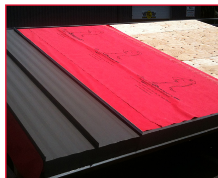
SlopeShield's unique Integrated Tape joints offer significant labor savings, allowing vertical installation concurrent with the metal roofing.